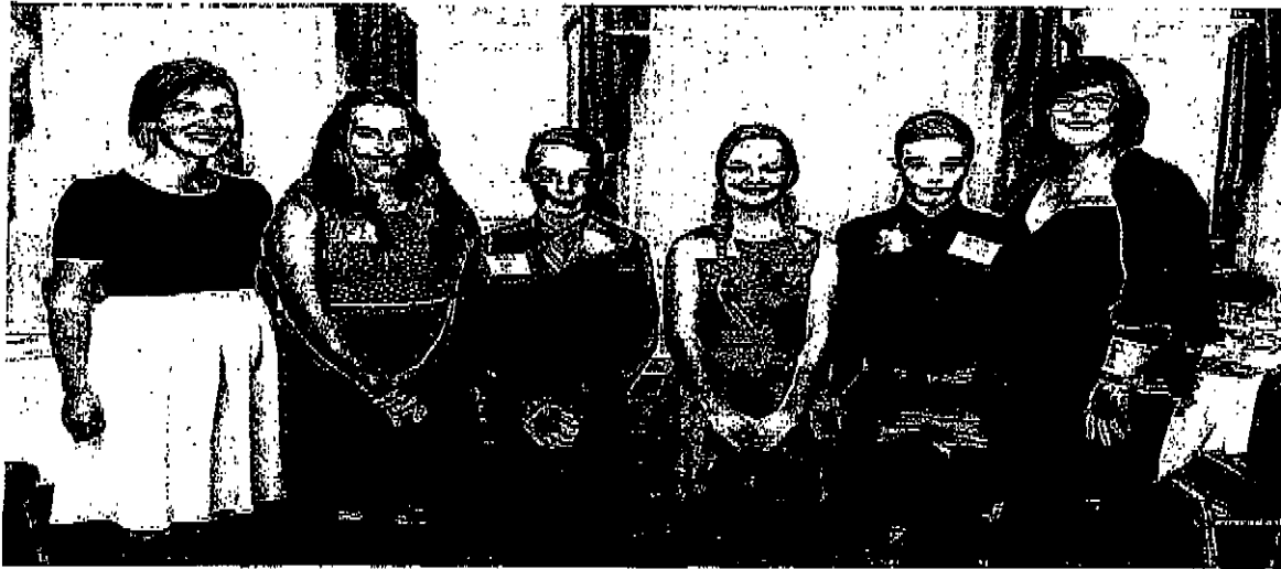
Junior Achievement Hall of Fame North Banquet