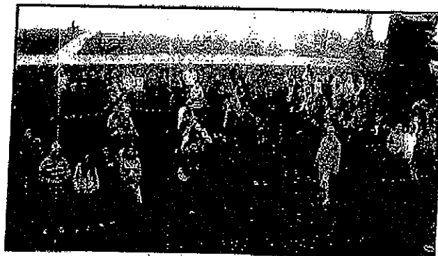
JMG middle school students and Specialists spell out "JMG" at the annual Leadership Education Conference.

For more information about Jobs for Maine's Graduates, please contact our Augusta office at 620-7180 or visit us online at www.jmg.org .